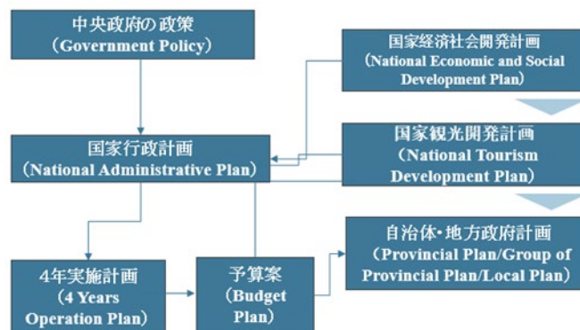
Figure: Systematic Chart Of Tourism Development Plan in Thailand