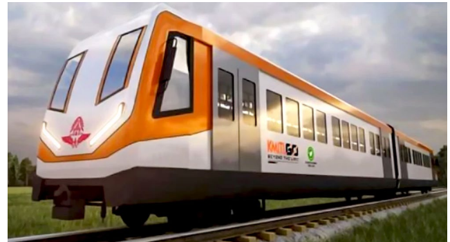
Figure : Battery-powered train concept

shunting locomotives within Bang Sue station), introducing distributed power train, electric-diesel hybrid train (400 cars)