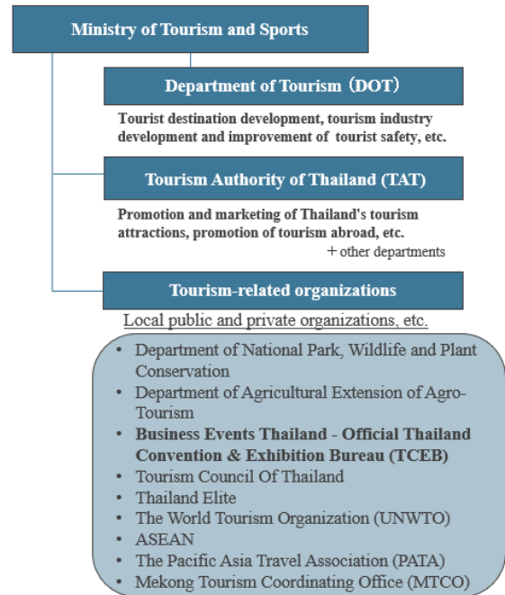
Figure: organizational chart of government agencies in the tourism industry of the Kingdom of Thailand.