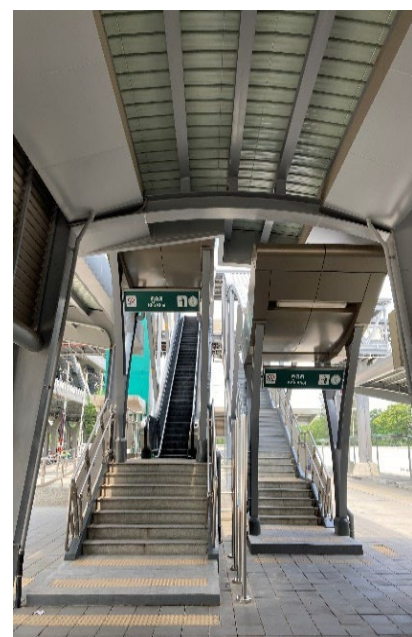
Photo-9 (left), Photo-10 (right): Raised escalators, elevators and stairs between the station and the P&R facility.