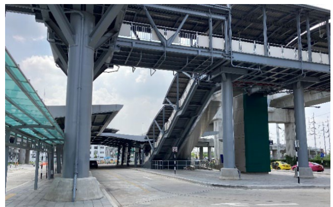
Photo-1: Buses and P&R facilities between the station and P&R facilities, stand-by space for general vehicles

The P&R facility is a 6 stories building which has multi-story parking garage with a parking capacity of 781 cars 11) (Photo-4). It is open from 05:00 to 01:00 in accordance with BTS service hours 11) . There is a barrier-free parking space near the entrance and exit of the each level (Photo-5), and wheelchair users can use the elevator