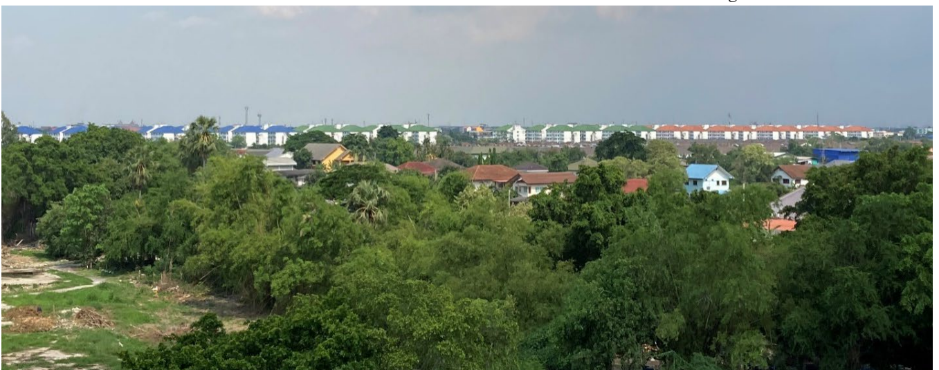
Photo-6: High-rise residential buildings seen from the platform at Khu Khot station

to move between the station and the P&R facility.